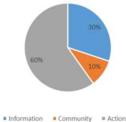
Figure 2: Percentage of Tweet Function

The action function aims to promoting and mobilising followers – to do something for the organisation (Lovejoy & Saxton, 2012). Tweets with information and community functions are also present in the top tweets – that reached the highest number of engagements for three months in April, June and August (see Figure 3).